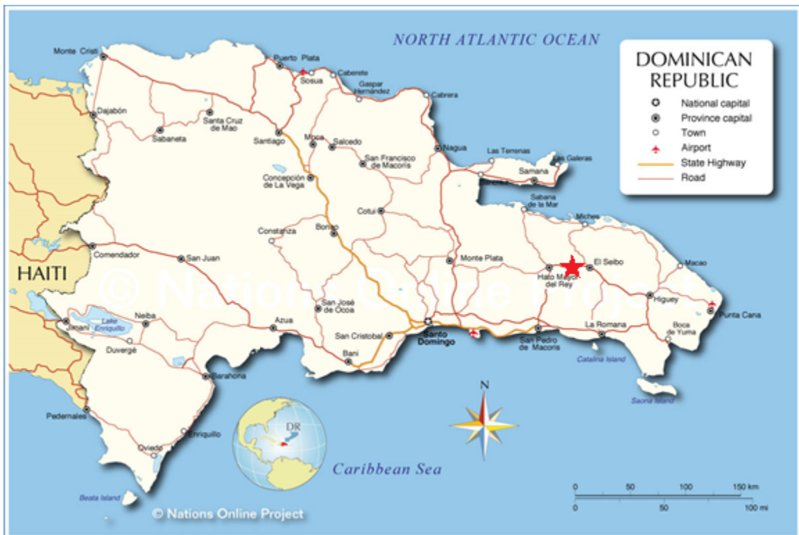
Figure 1: Map of the Dominican Republic, Nations Online Project

As a Peace Corps Volunteer (PCV) stationed in the Dominican Republic, I have unique access to rural, impoverished, and otherwise unknown areas through the extensive network of Peace Corps Volunteers within the country. Through this network I identified Batey El Prado, a batey in the Eastern region of the country between Hato Mayor and El Seibo, as an ideal location to accomplish this research.