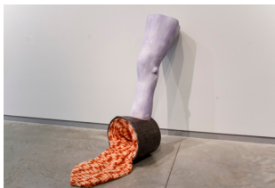
2019 MFA Biennial

Josh Roach. Leg (Scoop) , 2016. Blanket, papier-mâché, drywall compound, plaster, and paint. Installation view of 2017 MFA Biennial.