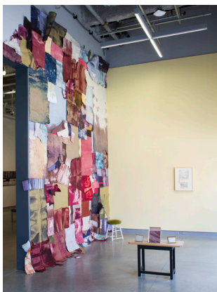
2019 Student Annual

Bethany Collins. May 2, 1963 (2) , 2017. Twice embossed archival newsprint, 25 x 19 inches.