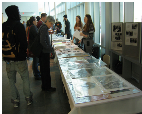
NEW's tables at the Publisher's Fair during the Mid America Print Council conference, November 3, 2012.

You can add your support to the Normal Editions Workshop Endowed Fund with your gift online by going to http://www.illinoisstate.edu and clicking on the "Make a Gift" tab. Be sure to choose a designation for your gift and type "Normal Editions Workshop" in the "Search Fund Designation" dialog box. Then finish your financial information and submit. We certainly appreciate your support!