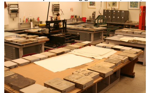
Some of the 90 new lithography stones awaiting storage slots in CVA 127 in June. Many still have interesting old commercial images on the back.