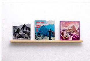
william cordova kuntur: sacred geometries balsa , 2008. Rephotographed photo of "Machu Picchu" by Martin Chambi (1929), Victor Jara's "Canto Libre" LP (1973), and Herbie Hancock's "Thrust" LP (1974) on custom Bolivian balsa wood shelf. 14 x 38 x 3 inches.

EXHIBITION EVENT SCHOOL OF ART RESEARCH COLLOQUIUM LECTURE VISITING ARTIST LECTURE