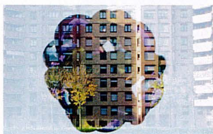
Basim Magdy To Hypnotize Them With Forgetfulness The Dent , 2014. Super 16mm film transferred to full HD video, 19:02 min. Commissioned by the Abraaj Group Art Prize 2014.