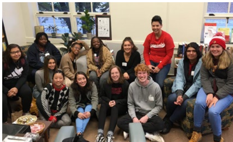
Undergraduate and graduate students attending Feminist Fridays

But, it is “The Combahee River Collective Statement;” All the Women Are White, All the Blacks are Men, But Some of Us Are Brave ; and, This Bridge Called My Back: Radical Writings by Women of Color —a genealogy of women of color writings—that underlie my conceptualization of Feminist Fridays as a fundamentally intersectional feminist consciousness-raising endeavor. In Eloquent Rage , Brittany Cooper writes that intersectionality is, “the idea that we are all integrally formed and multiply impacted by the different ways that systems of white supremacy, capitalism, and patriarchy affect our lives” (2018, 99). Feminist Fridays worked toward reclaiming and reimagining feminist consciousness-raising at a predominantly white institution (PWI), cultivated by students, staff, and