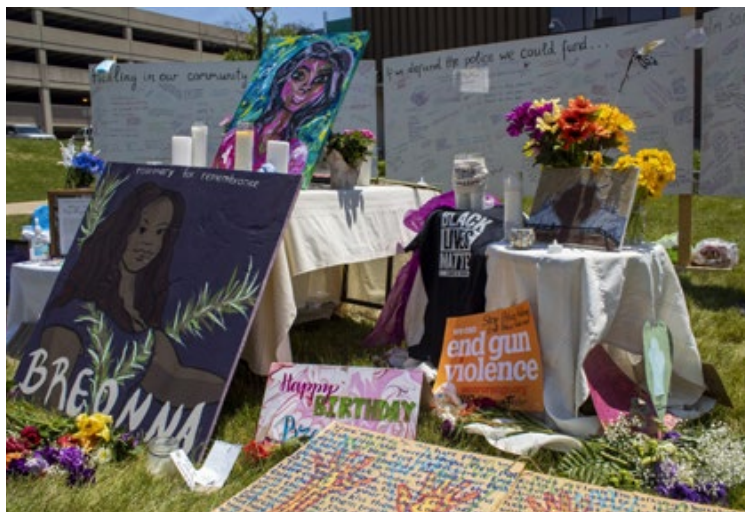
Memorial altar for Breonna Taylor at the Bloomington Law and Justice Center.