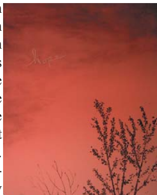
Hope by Michael Dubina

lithograph printed in black-brown ink on Arches Cover white paper. The retail price of this print is $100.00. Raffle tickets are only $1.00 each