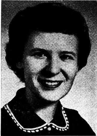
Greetings, Members of Alpha Beta Alpha:

We, as members of Alpha Beta Alpha, should be very proud of our Fraternity. Since the first chapter was established six years ago, we have grown rapidly, until at the present time we have fourteen chapters with another soon to be installed at Tallahassee, Florida. This speaks well of our Fraternity, as it shows that more and more colleges and universities are beginning to see the importance of librarianship and how Alpha Beta Alpha can further the library profession.