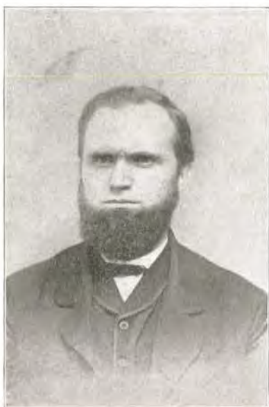
As he appeared at graduation