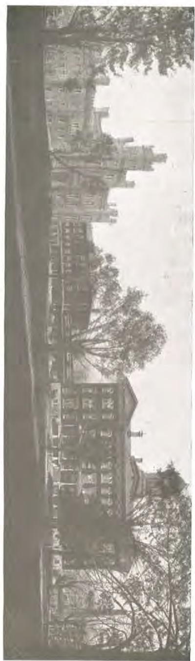
I. S. N. U. 1912