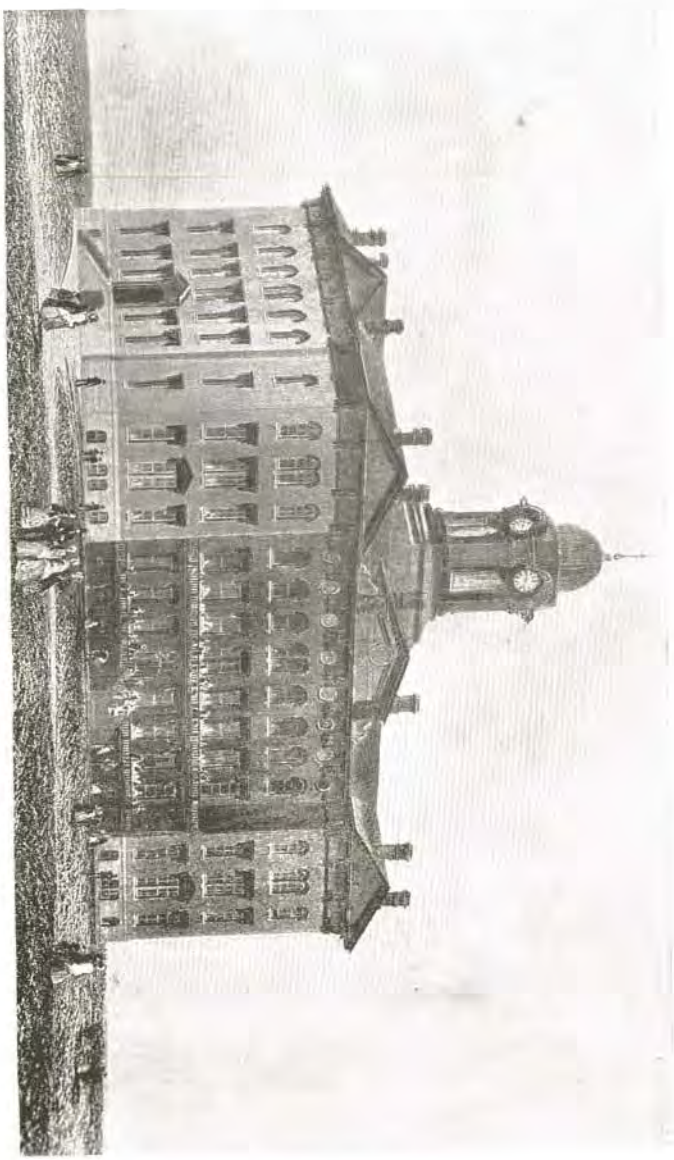
I. S. N. U. 1860