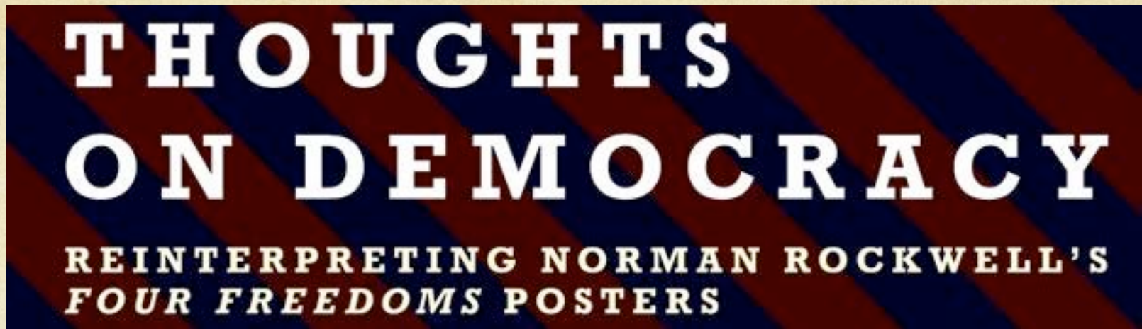
Exhibit by The Wolfsonian, a design museum at Florida International University

Over 80 graphic works by 60 contemporary artists and graphic designers