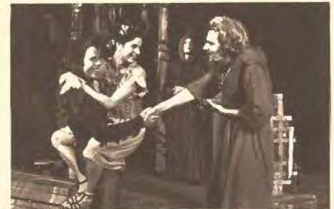
1978 Macbeth Twelfth Night As You Like It