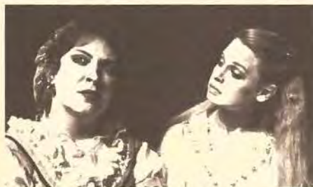
1982 Othello Love's Labour's Lost King Henry IV, Part 2