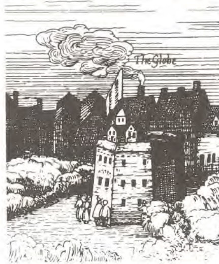
The Globe Theatre: detail from Visscher's 'View of London,' 1616.