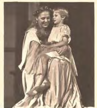
The Winter's Tale