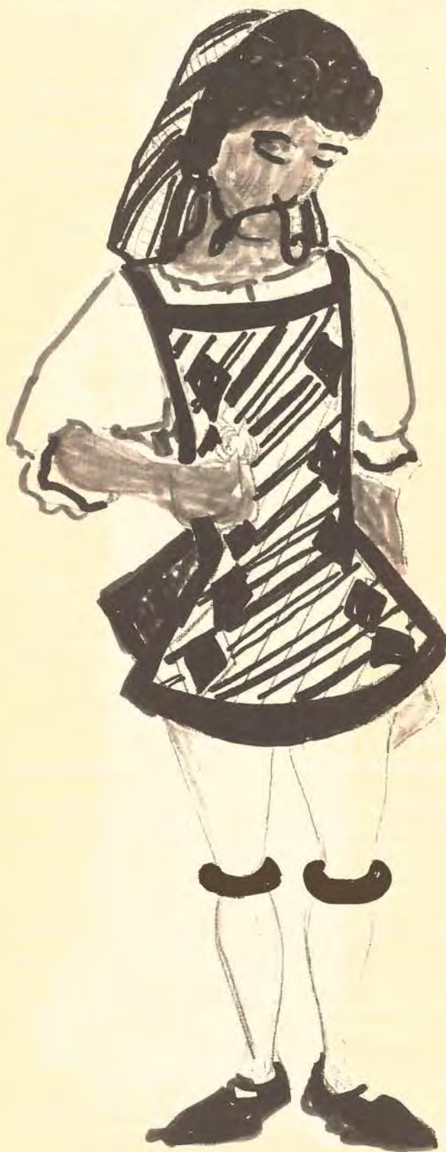
"Julia" Costume Design by Kent Streed

*indicates residence outside of Bloomington/Normal