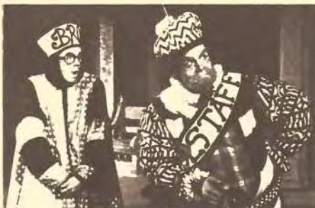
1980 Romeo and Juliet The Merry Wives of Windsor A Midsummer Night's Dream