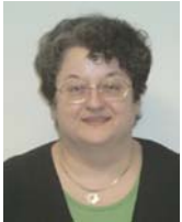
Martha Burk Chair