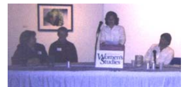
Panel 6 Subversive Readings