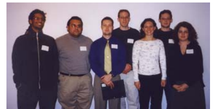
Panel 3 The Model UN: Representing the Association for Women's Rights in Development.