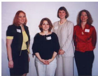
Panel 2 Women's History II