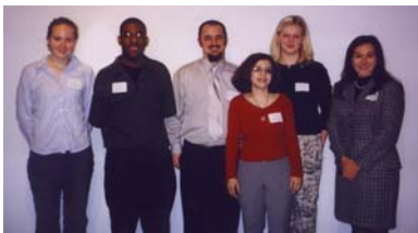
Panel 1 Women's History I