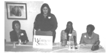
Panel 5 Women and Religion