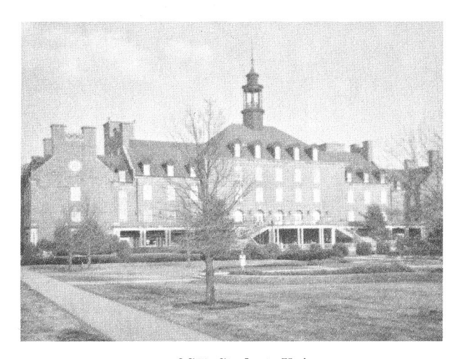
OSU Student Union National Convention Site