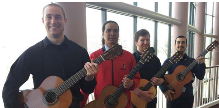
The ISU Guitar Quartet in Minneapolis.