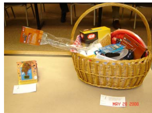
Photo of 2 nd and 1 st place prizes.