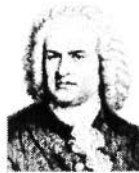
Johann Sebastian Bach to the Town Council Leipzig, August 24, 1736

My brightest hopes have come to nothing, the joys of friendship and love soon turn to sorrows, and even my pleasure in beauty itself is in danger of dying away! " Meine Ruh' ist hin, mein Herz ist schwer " - thus sang Gretchen at her spinning wheel. So might I know sing every day, for every night I go to bed hoping that I shall not awake again, and each only brings back all the sorrows and grief of the day before. And so I spend my days joyless and friendless.