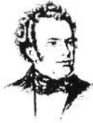
Franz Schubert to a friend Vienna, March 31, 1824

My brightest hopes have come to nothing, the joys of friendship and love soon turn to sorrows, and even my pleasure in beauty itself is in danger of dying away! " Meine Ruh' ist hin, mein Herz ist schwer " - thus sang Gretchen at her spinning wheel. So might I know sing every day, for every night I go to bed hoping that I shall not awake again, and each only brings back all the sorrows and grief of the day before. And so I spend my days joyless and friendless.