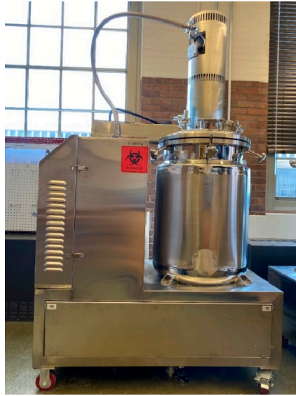
Figure S1. The pilot-scale anaerobic digester.