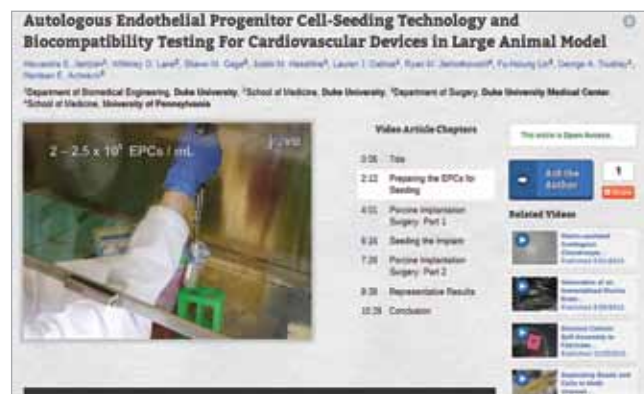
A JoVE open access article showing chapters, social elements of querying the author directly and sharing with colleagues, and related videos