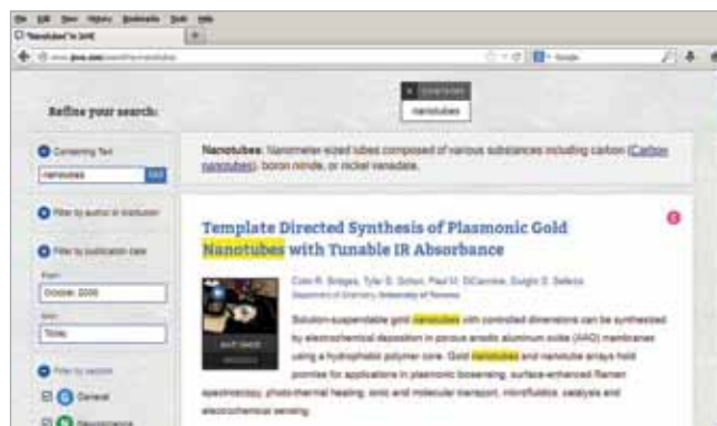
Search results can be limited by author, institution, date, and subject section. Some results show a definition of search terms at the top of the video.

The JoVE platform, with its reverse engineering designed specifically for video material, provides opportunities for